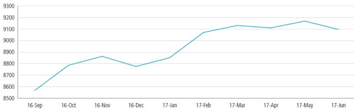
Figure 2: U.S. Oil Production (000's Bbl/d)

Oil inventories are correcting (the oil “glut” versus the 5-year average has fallen by 44% as of the end of July) as OPEC compliance remains good, global demand growth continues to exceed expectations (1.8MM Bbl/d YOY?), and US production growth stalls . Wait a second...what did you just say!?!?