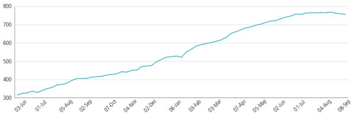
Figure 3: U.S. Oil Directed Rig Count