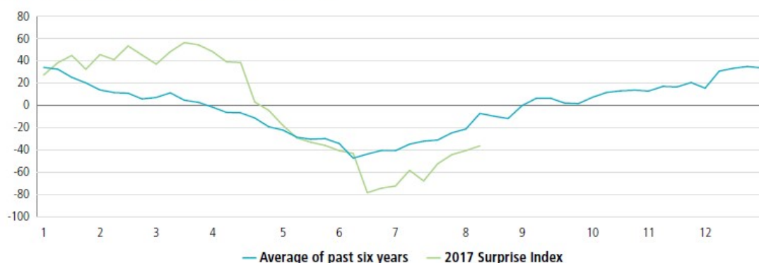
Figure 3: US Economic Surprise Seasonality